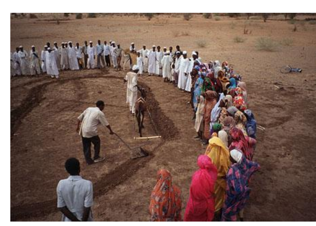
Demonstrating a donkey plough - Darfur Sudan