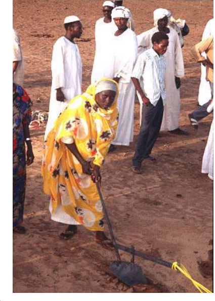
Practical Action Sudan

After the demonstrations local farmers explained that they were now able to break up the soil's surface crust and plough big ridges. This meant that precious rainfall was captured and allowed to soak into the soil, instead of being lost. Some farmers mentioned that the ploughing also made subsequent weeding easier.